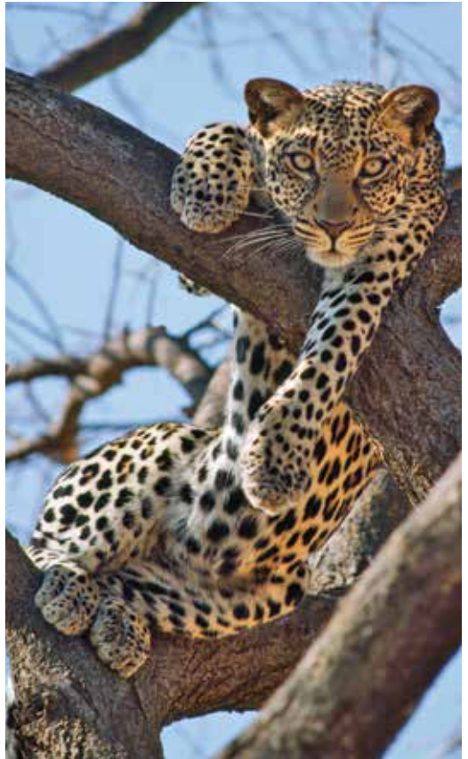
Getting comfortable ...

Day 14: Arrive U.S. We arrive in the U.S. this morning and connect with our flights home.