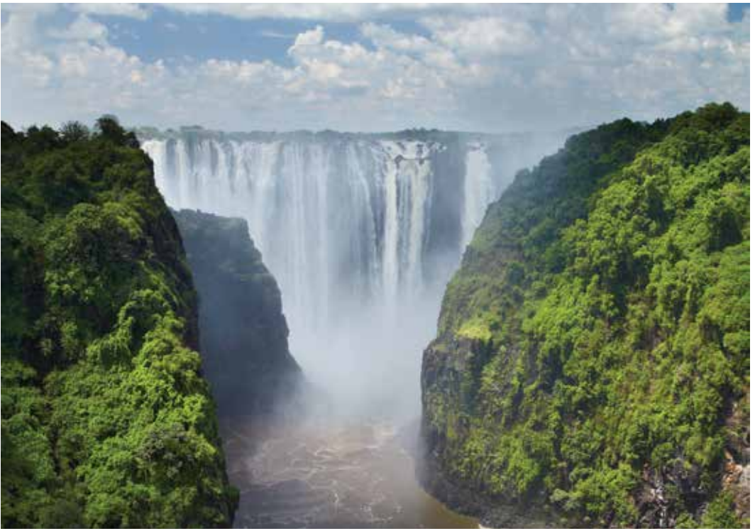
Known as the “Smoke that Thunders,” Victoria Falls is one of the wonders of the natural world.

River, where we may see hippo, crocs, and some of the park’s 450 species of birds (including the sacred ibis, carmine bee-eaters, fish eagles, and kingfishers). We dine tonight at our lodge. B,L,D