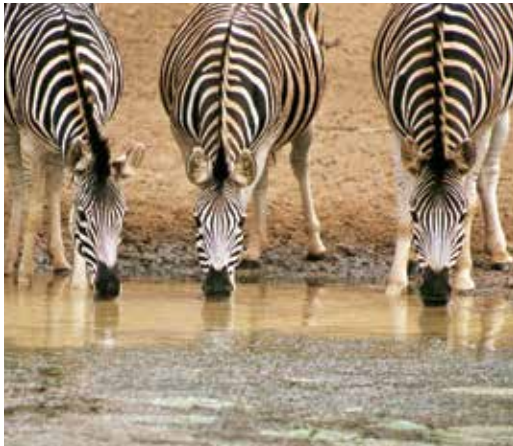
Zebra roam freely in Chobe National Park.