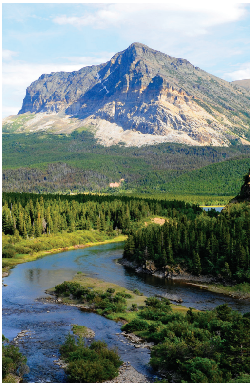
A magnificent vista in Glacier National Park