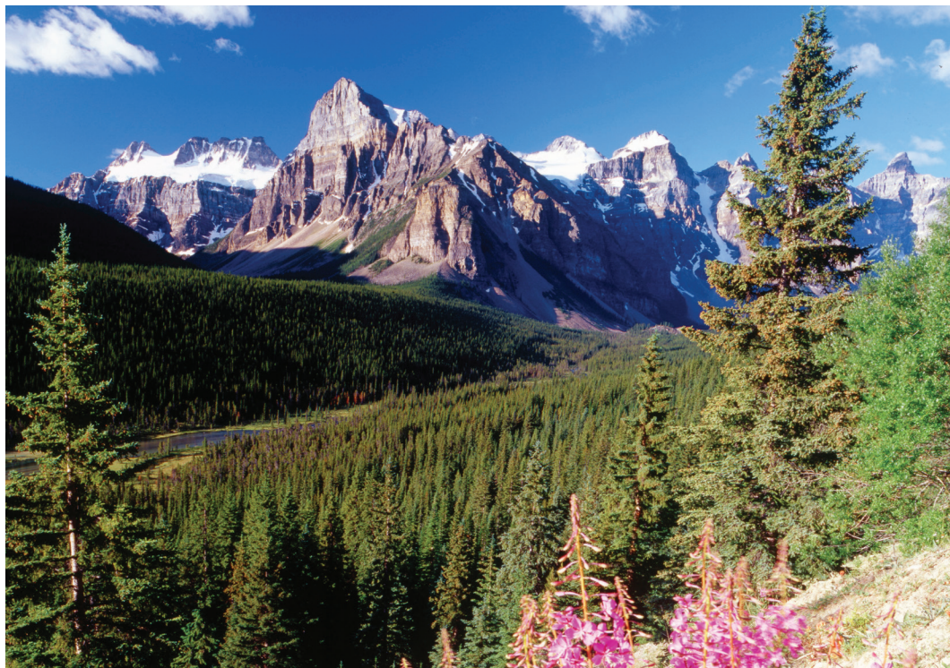
Five national parks sit within the Canadian Rockies.

winding mountain pass that offers breathtaking views and hair-raising turns. After time for lunch on our own we meet up with our motorcoach and continue southwest across the Continental Divide. After arriving late this afternoon in the resort town of Whitefish, Montana, we dine together tonight. B,D