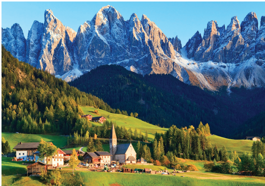
We enjoy stunning scenery in the South Tyrol.

Day 7: Santa Margherita/Cinque Terre/Portovenere We depart this morning by train for the Cinque Terre (literally, “Five Lands”), the five cliff-clinging villages seemingly carved from the mountains. Originally medieval fishing villages, the Cinque Terre were inaccessible by land for centuries. We stop in scenic Vernazza and board a boat for a comfortable cruise along the rugged coastline to visit another village of the Cinque Terre. From here we cruise to the port town of Portovenere, with its cluster of colorful column-shaped houses. After a brief walking tour of the Old Town, we have time to explore and enjoy lunch on our own. We dine together tonight at our hotel. B,D