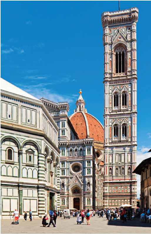
Florence, birthplace of the Renaissance