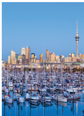
Auckland, City of Sails

Day 19: Rotorua This morning we visit Rainbow Springs Nature Park, a showcase of native flora, fauna, and birdlife, and where we tour the National Kiwi Trust, which rehabilitates injured kiwis, the national bird. B