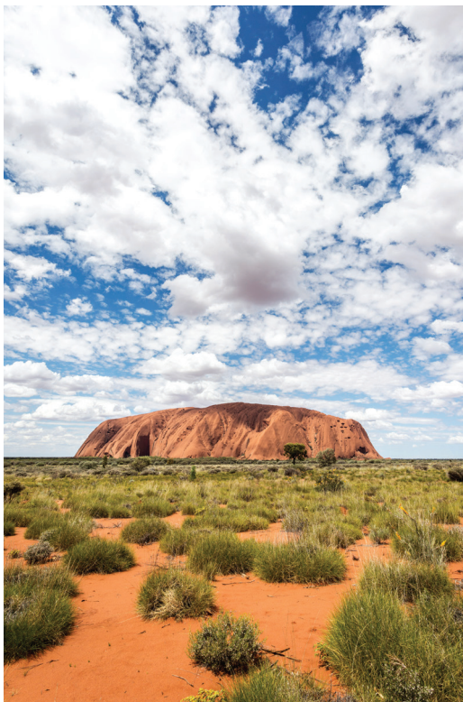
We visit the Aboriginal site of Uluru (Ayers Rock) on Day 6.