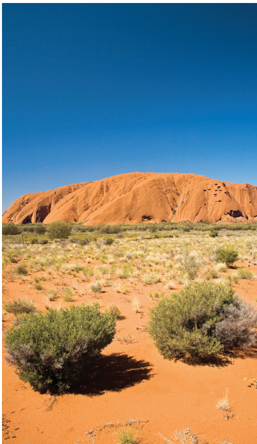
Aboriginal site of Uluru (Ayers Rock)