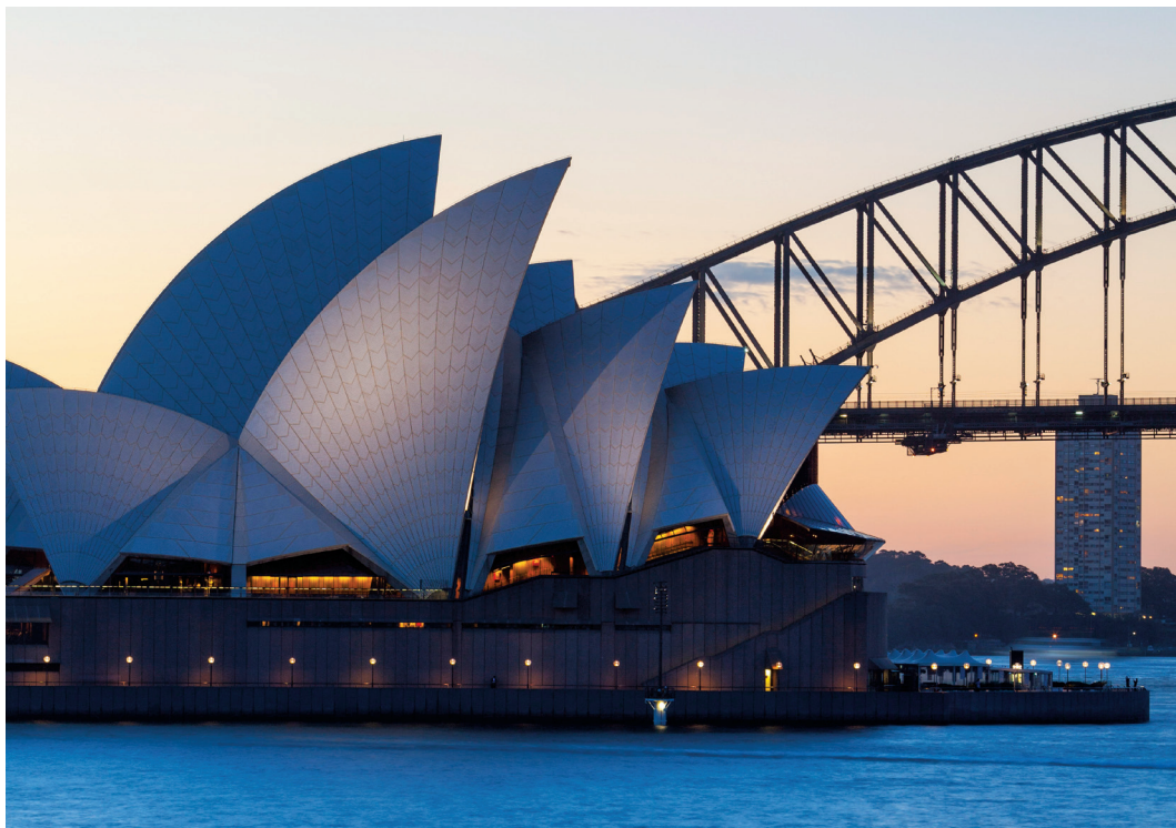
Sydney's signature Opera House and Harbour Bridge

Day 9: Cairns/Great Barrier Reef This morning we board a boat for a day-long excursion to the Great Barrier Reef, at 1,200 miles long the world's largest living organism and richest marine resource. We pull up at Michaelmas Cay where we can swim, snorkel, or view the reef from a semi-submersible vessel. B,L