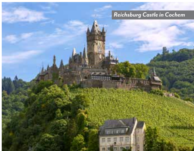
Reichsburg Castle in Cochem

Begin your walking tour in the Weinmarkt and the Chapel Bridge, then see the Lion Monument, dedicated to the Swiss Guards who gave their lives during the French Revolution. Reach Mount Pilatus'