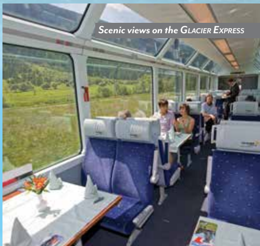
Scenic views on the GLACIER EXPRESS

Admire the awe-inspiring, visionary work and vast scope of Switzerland's impressive railways as you experience the sublime majesty of the iconic Alps from incredible perspectives. Journey on three of the world's great Alpine railways—the panoramic GLACIER EXPRESS, the scenic GORNERGRAT BAHN, and the dramatic PILATUS RAILWAY. While admiring the innovative engineering necessary to create these routes, savor vignettes of the quintessentially Swiss landscape—including 14,000-foot-high mountain peaks, flowing streams, cavernous gorges, and crystalline glaciers.