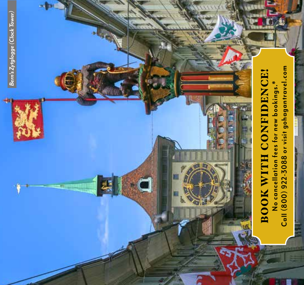
Bern's Zytglogge (Clock Tower)

PRSRKT STD U.S. Postage PAID Gohagan & Company