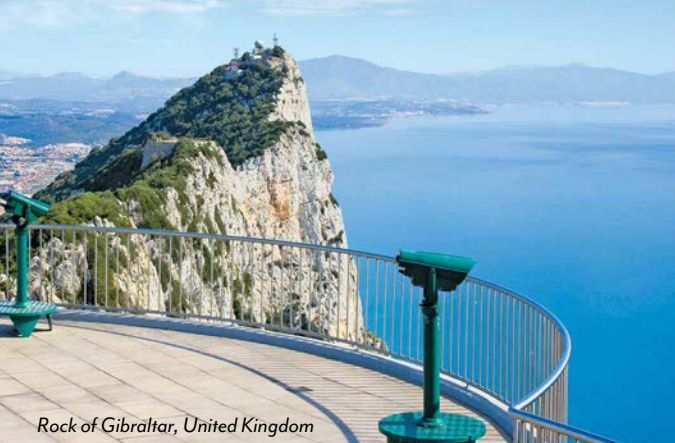
Rock of Gibraltar, United Kingdom