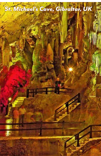
St. Michael's Cave, Gibraltar, UK

boundary of the known world. You can walk up a steep road to stand on the “Top of the Rock” — a nearly 1,400-foot-high limestone promontory — and enjoy expansive views across the strait separating Europe and Africa. From there, witness the impressive stalagmites and stalactites in St. Michael’s Cave and watch the amusing antics of Barbary macaques, Europe’s only colony of wild monkeys. The tour concludes at the Great Siege Tunnels, excavated by British Army engineers in the late 18th century to provide defense for the colony.