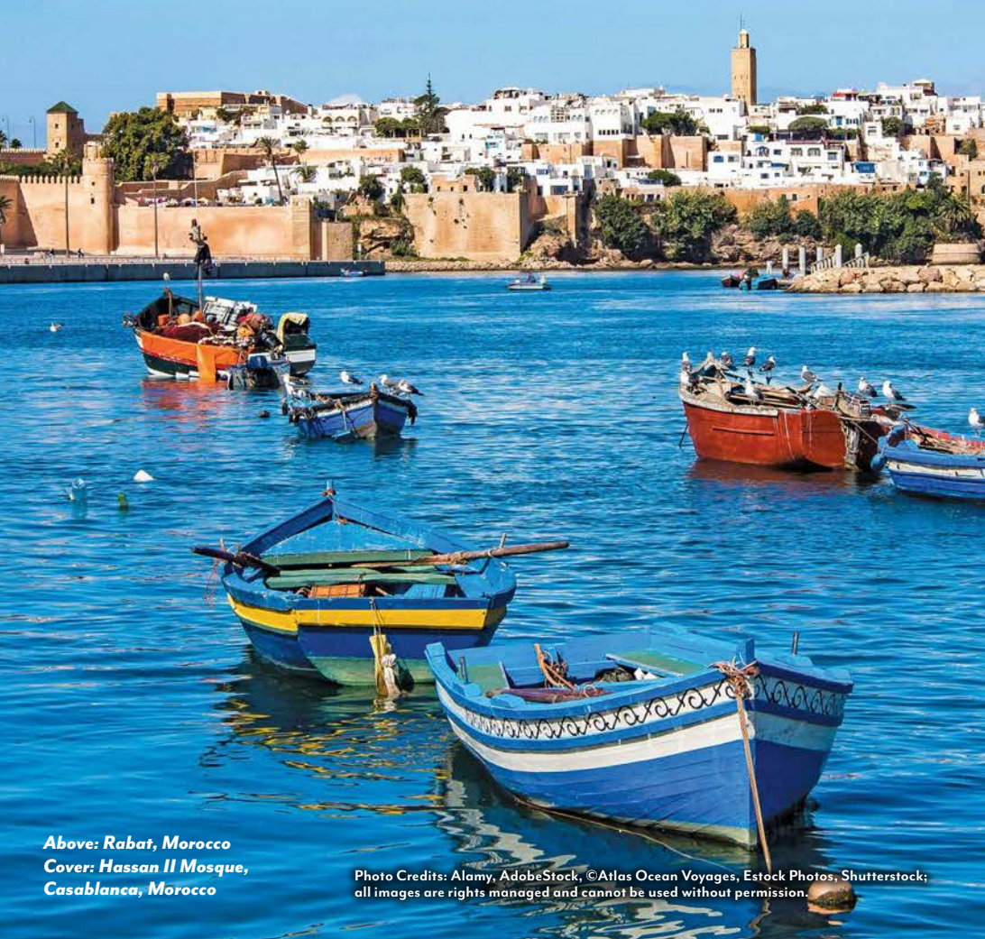
Above: Rabat, Morocco Cover: Hassan II Mosque, Casablanca, Morocco

Photo Credits: Alamy, AdobeStock, ©Atlas Ocean Voyages, Estock Photos, Shutterstock; all images are rights managed and cannot be used without permission.