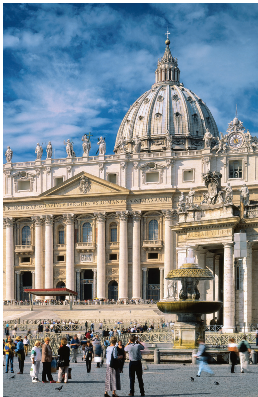
We visit St. Peter's Square and Basilica on Day 7.