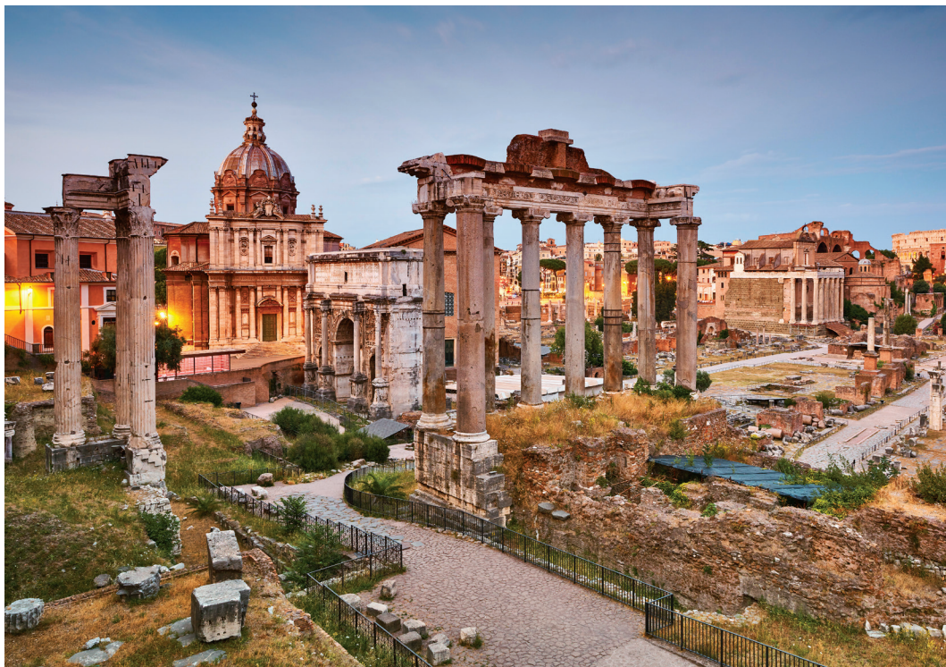
The Roman Forum dates to the 7 th century BCE.

building; tossing a coin into Trevi Fountain; or visiting any number of renowned museums and churches. B