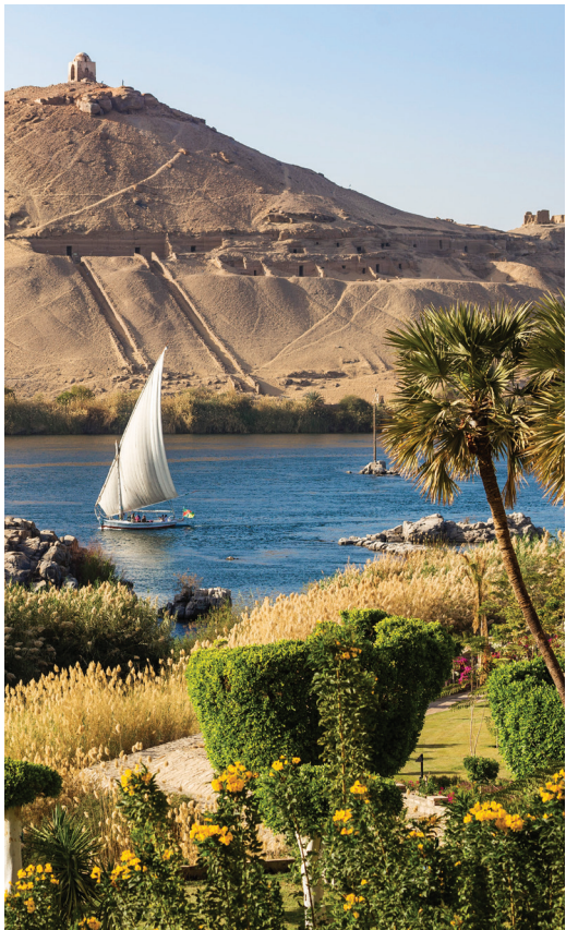
We sail traditional feluccas along the Nile.

Day 15: Depart for U.S. Very early this morning we transfer to the airport for our return flight to the U.S. B