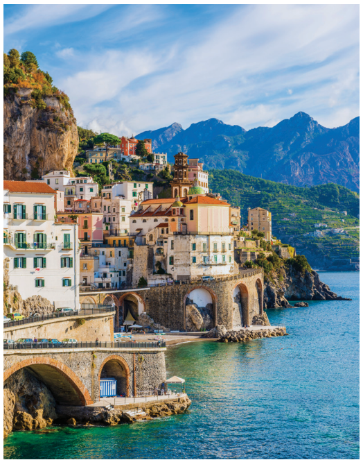
The Amalfi Coast has drawn visitors for centuries.

Day 14: Sorrento/Amalfi Coast We embark this morning on a breathtaking drive along the winding, cliff-top Amalfi Coast road between Sorrento and Amalfi above the glistening Tyrrhenian Sea – with stops for photos along the way. This afternoon is at leisure; tonight we bid “ arrivederci ” to Italy and our fellow travelers at a farewell dinner. B,D