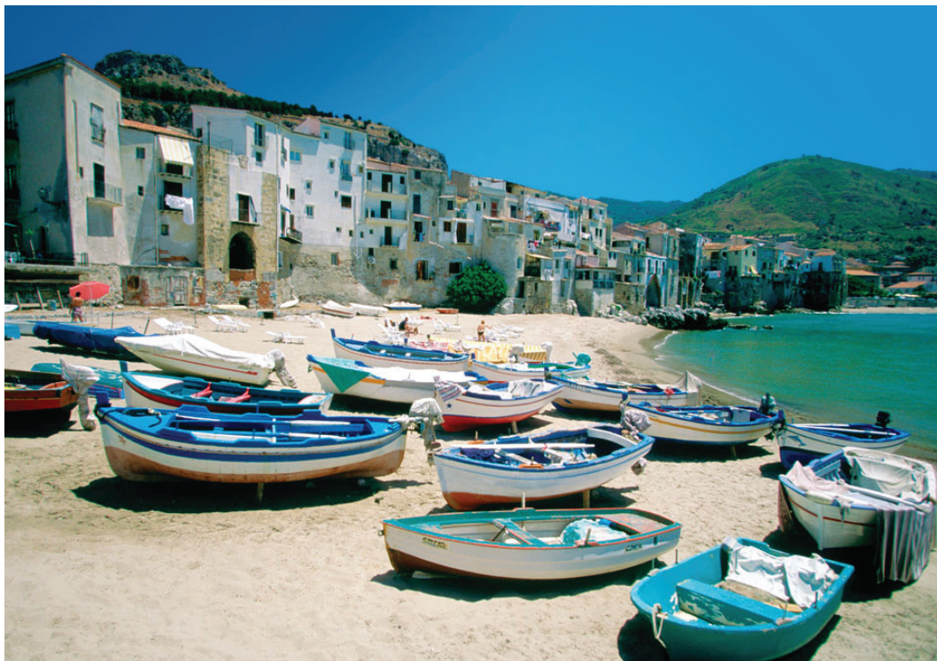
Colorful fishing boats along a Sicilian harbor

Day 6: Taormina/Matera We leave Sicily today for the mainland region of Basilicata, a day-long transfer that includes a ferry ride from Sicily to Calabria. Late this afternoon we reach Matera, whose historic troglodyte churches and dwellings ( Sassi ) have been designated a UNESCO site and where our hotel is a renovated cave dwelling in the city's historic district. B,D