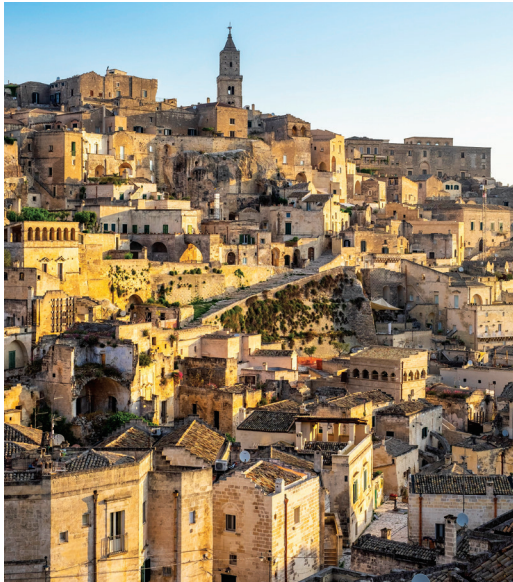
We spend two nights in ancient Matera.

Day 15: Depart for U.S. This morning we transfer to Naples airport, where we connect with our return flight to the U.S. B