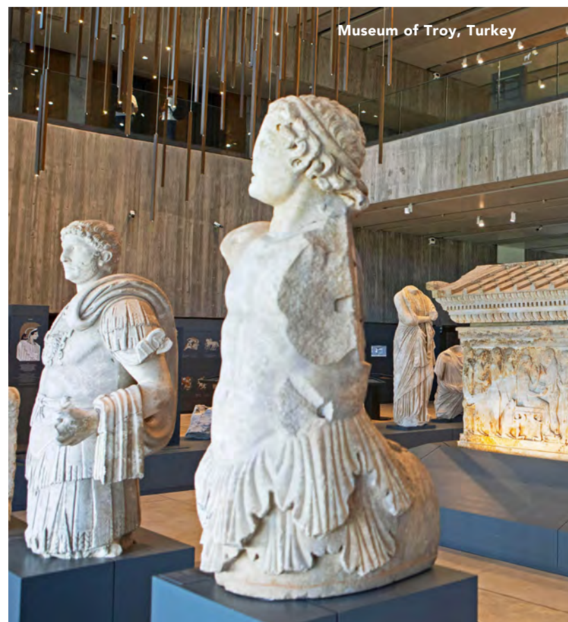
Museum of Troy, Turkey

Alternatively, join an expert guide in Ephesus , whose history spans classical Greece, the Roman Empire, and early Christianity. St. Paul, who spread the Gospel in Ephesus for three years (circa 53-56 A.D.), addressed the city's Christian community in his famous Epistle to the Ephesians.