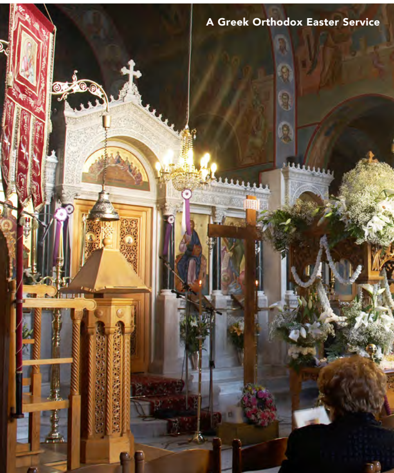
A Greek Orthodox Easter Service

Visit the Volos Archaeological Museum , where ancient stories come to life through intricately painted stelae dating from the third century B.C. Then choose between two expert-led excursions. You may ascend to the heavenly heights of Makrinitza atop Mount Pelion, the mythical homeland of the half-man, half-horse Centaurs. At the top, stroll along honeysuckle-scented cobblestone paths past grand mansions and enjoy lunch at leisure.