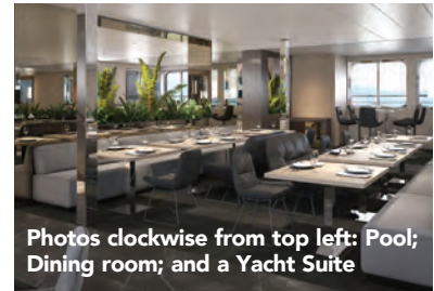
Photos clockwise from top left: Pool; Dining room; and a Yacht Suite