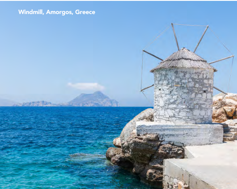
Windmill, Amorgos, Greece

Expect fresh, locally sourced meals thoughtfully crafted by expert chefs and appreciate the ocean breeze from the large al fresco terrace. Have a nightcap in the plush, relaxed atmosphere of the Horizon Bar & Lounge. Unwind completely in the onboard Wellness Center, where a selection of indulgent spa treatments includes massages, facials, and even a hairdresser. Complimentary Wi-Fi is available and a full selection of bikes is on board for your use.