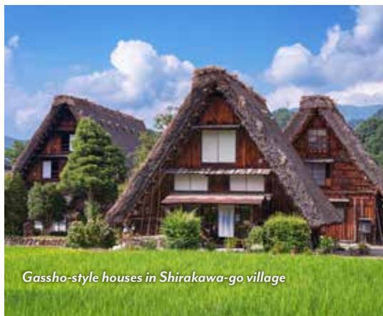
Gassho-style houses in Shirakawa-go village