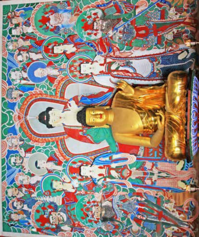
Bulguksa Temple, South Korea

Early Booking Savings* available | Save $2,000 per couple!