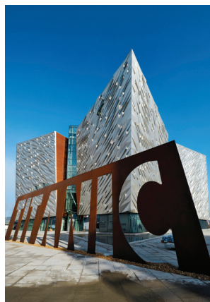
Titanic Museum, optional extension

tour of Kilkenny itself, noting the many buildings of “black” or Kilkenny marble, quarried locally. After lunch together at a local pub, the remainder of the day is at leisure. B,L