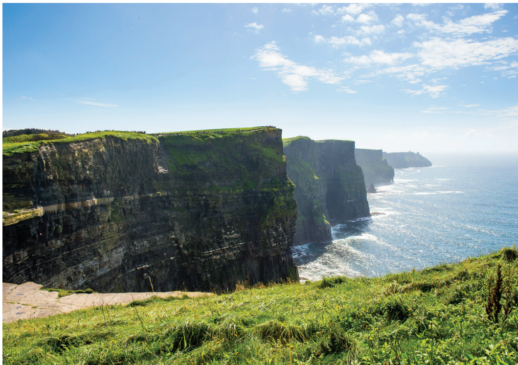
The sun shines down on the Cliffs of Moher, as we see on Day 7.

here, imparting local lore along the way. We stop at Dun Aengus Fortress, the three prehistoric stone walls crowning the tallest cliffs of Inishmore; have lunch in a local pub; and enjoy some free time before returning to the mainland and our hotel late this afternoon. Dinner tonight is at a local restaurant in the village of Bearna. B,L,D