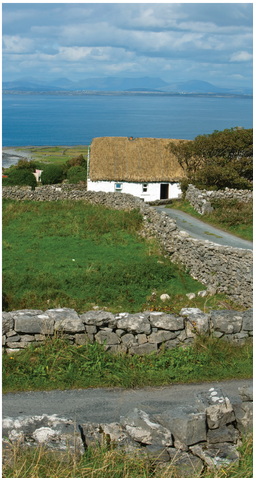
We spend Day 6 on the Aran Islands’ Inishmore.