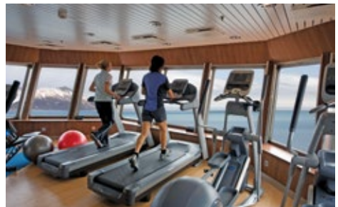
Fitness center with panoramic views.

Every staff member is committed to ensuring guests have an unforgettable experience. Many of the veteran guides and naturalists are locally based and have worked with the company for decades. A full-time medical professional, undersea specialist, National Geographic photographer and certified photo instructor are on board, and with a low staff-to-guest ratio, you can hear different perspectives and gain new insights every day.