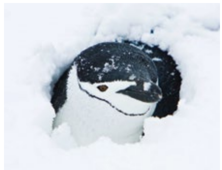
A chinstrap penguin burrowed in the snow.

This morning, the ship will be moored off of King George Island once again. Following disembarkation and Zodiac rides to shore, the flight departs the White Continent and returns to Puerto Natales for an overnight stay. (B,L,D)