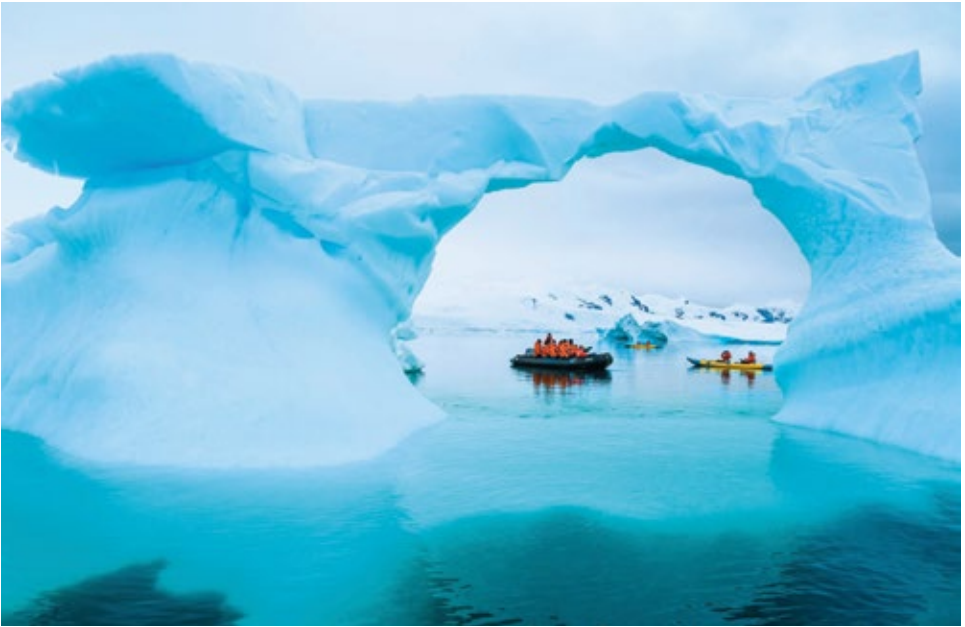
Guests exploring by Zodiac in Antarctica.

cruise amid porpoising penguins. While wildlife is magnificent, ice defines the Antarctic. You'll get to know ice up close and personal—from icebergs the size of islands, bergy bits and near-vertical glaciers, to the fragile, nearly invisible layers that have just begun to freeze. One day, you might set out by kayak to encounter towering icebergs at water level; embark on a Zodiac excursion in search of seals and blue-eyed shags; or walk amid thousands of Adélie and gentoo penguins. The next, you might experience the thrill of the ship crunching through pack ice. In Antarctica, opportunities abound to capture uniquely beautiful images. Along the way your expert expedition team will enrich every experience. (B,L,D)