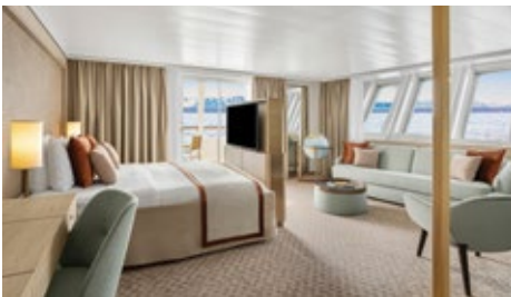
Newly renovated Category 7 suite with balcony.

All cabins and suites face outside with windows or portholes, and have a private bathroom and climate controls. Equipped with Wi-Fi, multiple electrical outlets, USB outlets, full-length mirror