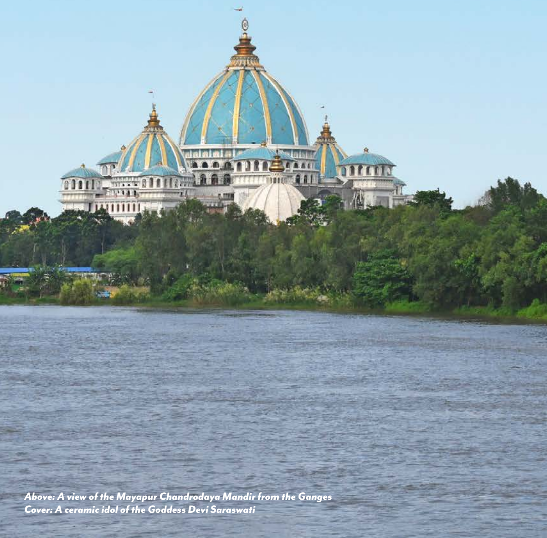
Above: A view of the Mayapur Chandrodaya Mandir from the Ganges Cover: A ceramic idol of the Goddess Devi Saraswati