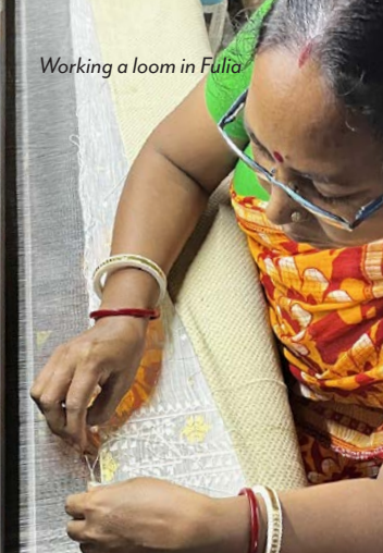
Working a loom in Fulia