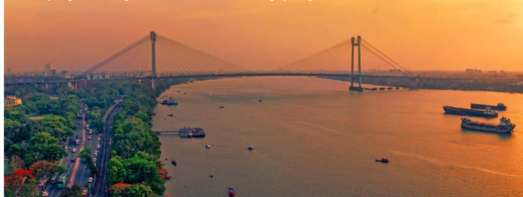
The Vidyasagar Setu bridge, also known as the Second Hooghly bridge, Kolkata

Hop on an eco-friendly e-rickshaw this morning for your ride to the Hindu Shri Haneswari Temple, with its unique design and rich symbolism. Stroll among the landscaped gardens