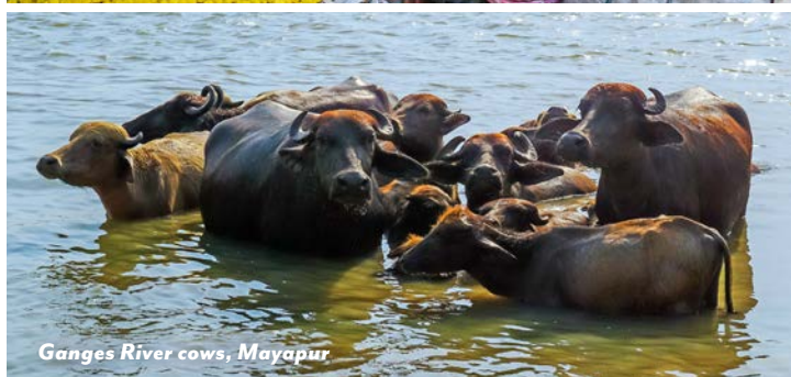
Ganges River cows, Mayapur