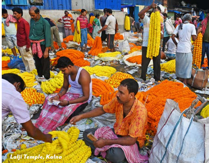
Lalji Temple, Kalna