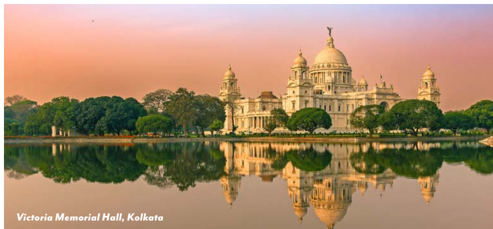
Victoria Memorial Hall, Kolkata

For more information, please call Gohagan & Company at (800) 922-3088.