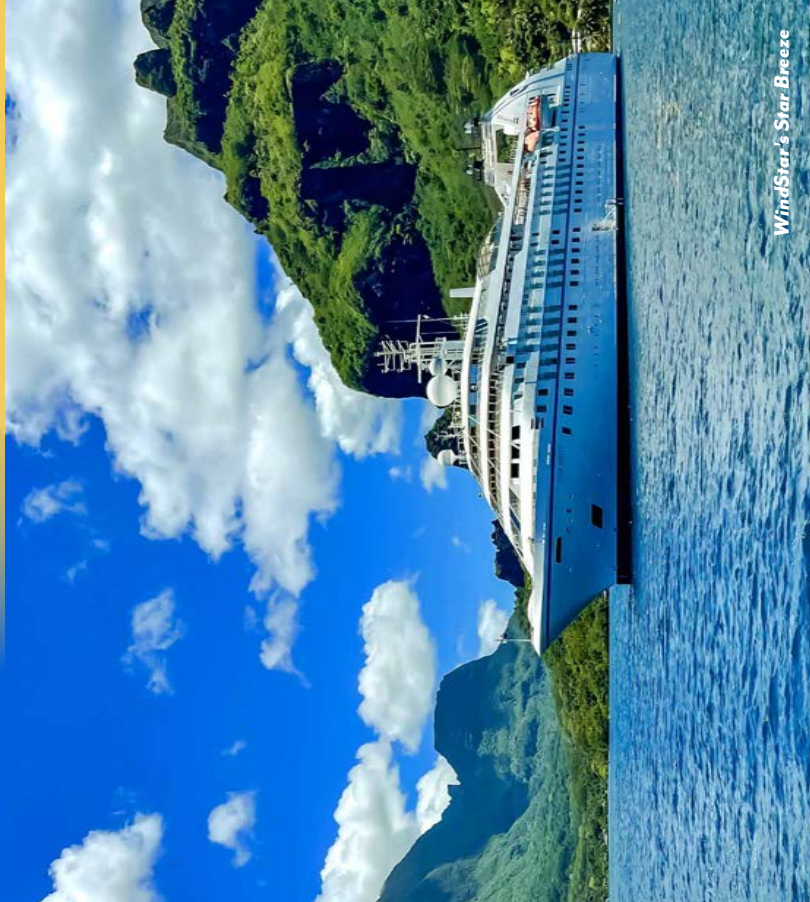
WindStar's Star Breeze