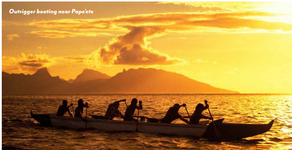
Outrigger boating near Pape'ete

For reservations, call Gohagan & Company at 800-922-3088 or visit gohagantravel.com/reserve