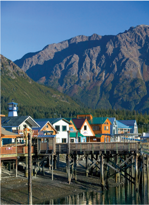
Colorful buildings overlook Seward’s harbor.

in a safe environment. Tonight, we celebrate our journey through Alaska at a farewell dinner. B,D