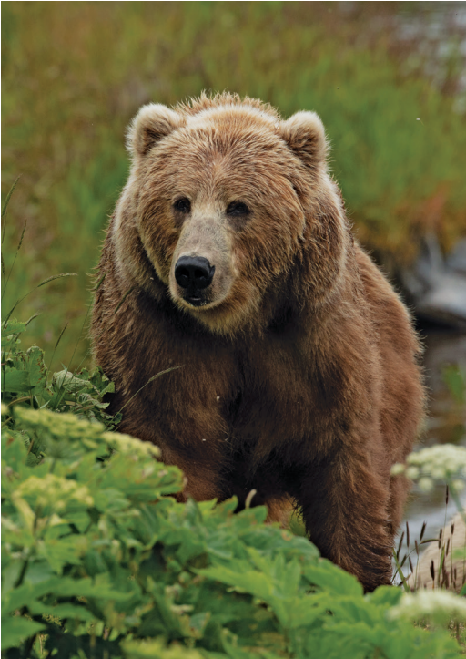
We may see bears in Alaska.

Day 10: Seward/Anchorage Today we return to Anchorage, stopping for lunch on our own on the way. Upon arrival in Anchorage, we visit the Alaska Wildlife Conservation Center, a non-profit organization dedicated to providing quality animal care and preserving Alaska’s wildlife. With 200 acres of spacious enclosures, the center offers an opportunity to see injured or orphaned bears, moose, elk, wolves, caribou, and more display their natural behavior